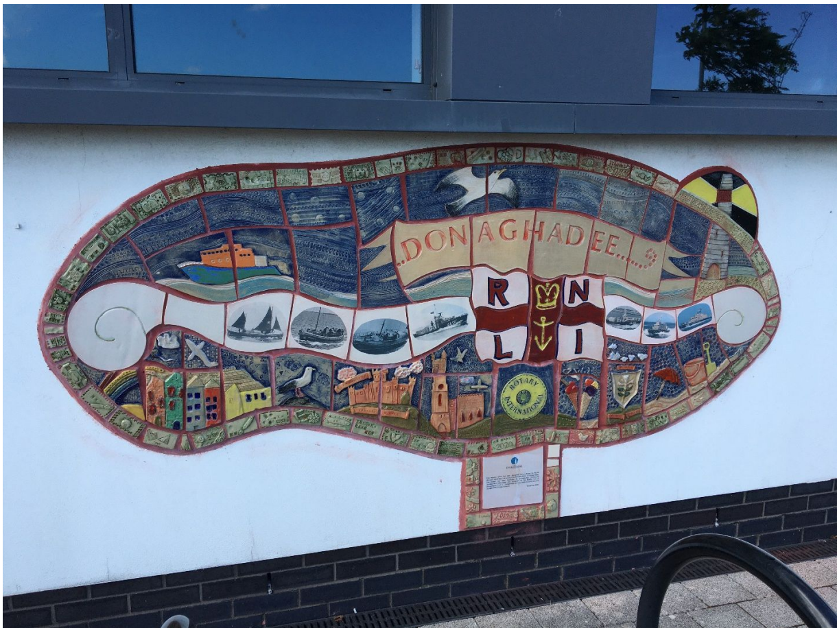
The Donaghadee RNLI Mural